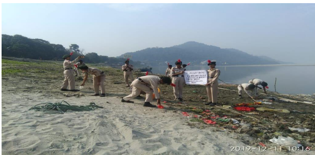
Figure 2: Cadets cleaning the river side during Clean India Green India drive