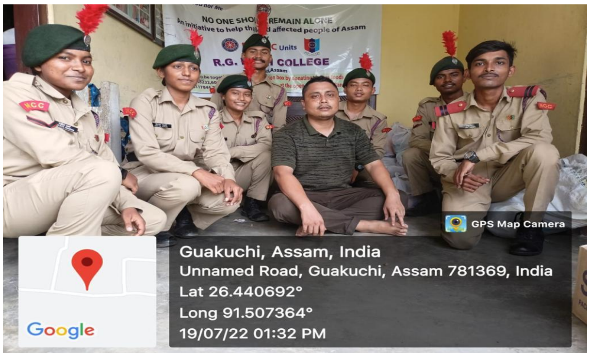
Figure 10: A sense of happiness after distributing flood relief material at Chatra village Nalbari