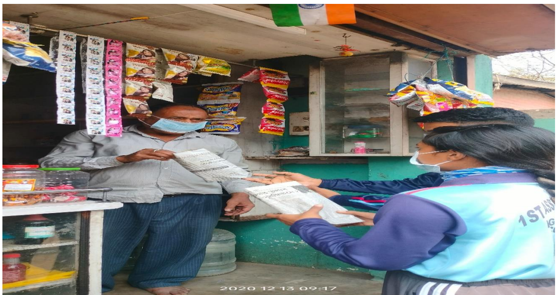
Figure 8: Cadets interacting with the local shopkeepers regarding the use of paper bags to control plastic waste