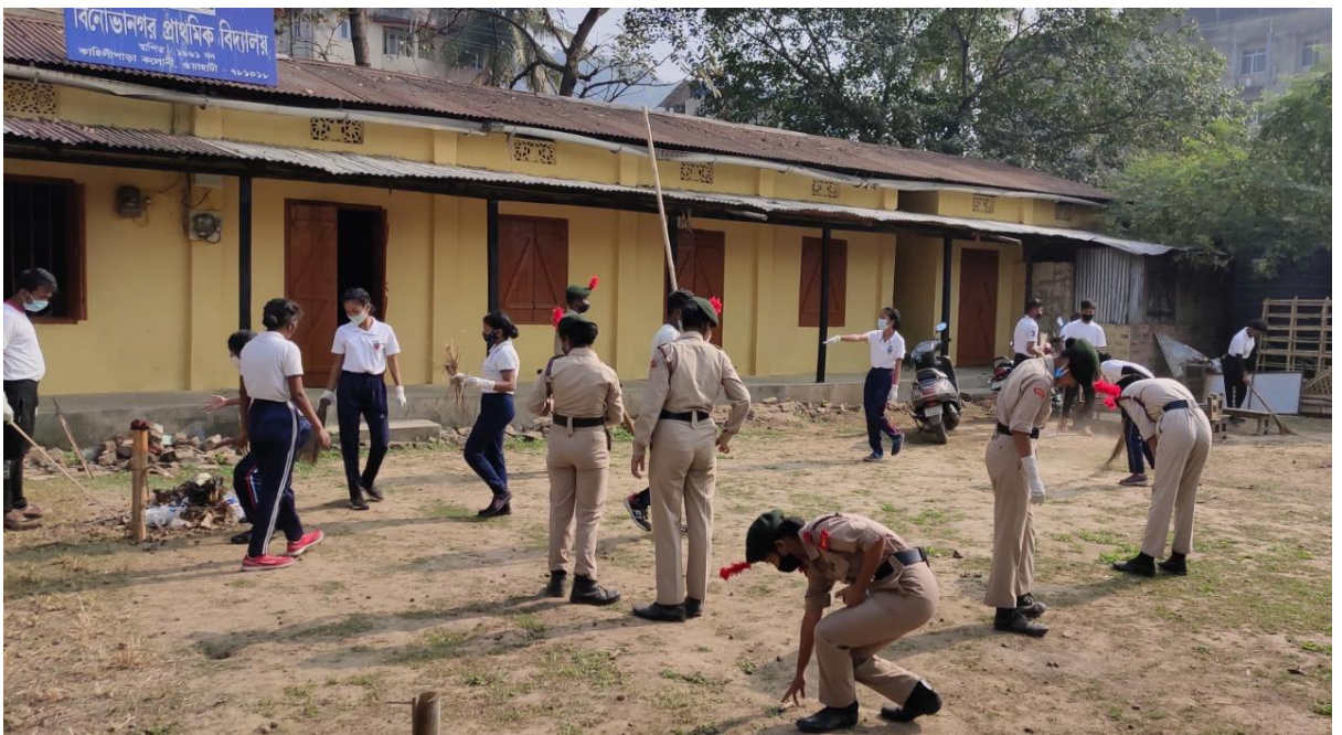
Figure 6: Cadets while cleaning the school playground of Binova Nagar LP school