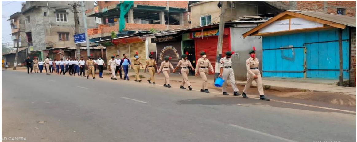
Figure 3: Cadets marching for the plogging event

On December 10, 2020, the unit organised a plogging event that commenced from the college grounds and extended all the way to Fatashil Chariali. The event saw the active involvement of 17 dedicated cadets who wholeheartedly engaged in the task of picking up litter from the roadside, demonstrating a strong sense of social responsibility and commitment to our community.