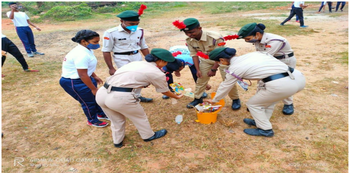
Figure 4: Cadets cleaning the nearby school playground