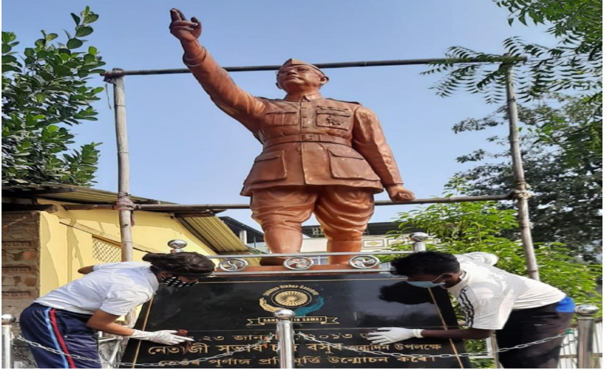
Figure 5: Cadets while cleaning the statue of Netaji Subhash Chandra Bose

As a part of Swacchta Pagoda, the Unit organised a drive to clean the monuments of the nearby area on December 11, 2020 as a contribution to the Swacchta Abhiyan. In a parallel endeavour, the unit conducted a cleanliness drive at Binova Nagar L.P. School, Kalapahar, Guwahati on December 12, 2020, to showcase its commitment to promote cleanliness and hygiene in the community.