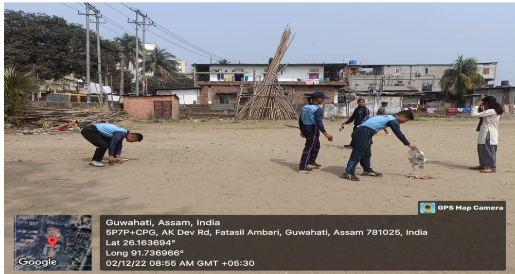
Figure 13: Cadets collecting plastic waste from the surrounding areas outside the college campus

On December 2, 2022, in observance of Pollution Control Day, the Unit organised a cleanliness campaign. The focus of this drive extended to both our college campus and the surrounding areas. A noteworthy total of 20 cadets actively engaged in the event, emphasizing their commitment to pollution control.