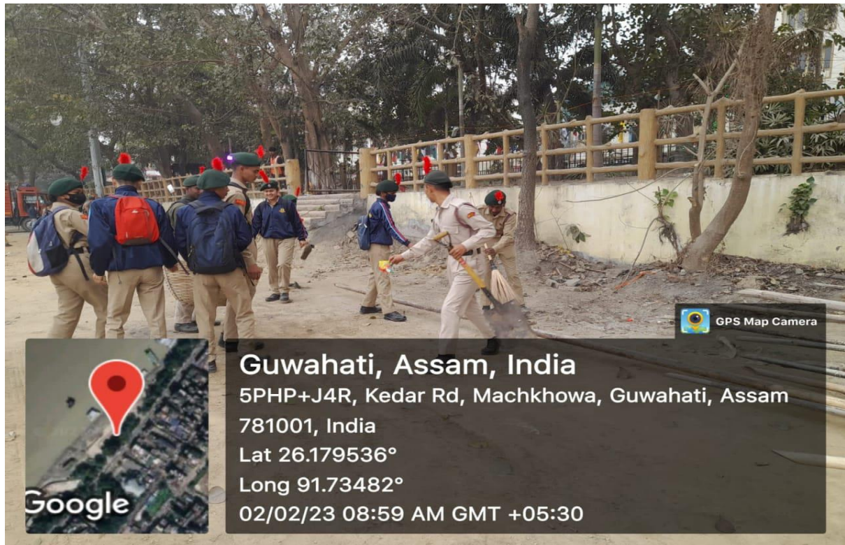
Figure 15: Cadets participating in plogging event near Lachit Nagar

A total of 15 cadets participated in Puneet Sagar Abhiyan as a part of World Wetlands Day on February 02, 2023. They did plogging in Brahmaputra River, Lachit Nagar. Total of 15 cadets participated. Their dedication and involvement in this drive marked a significant contribution to the cause.