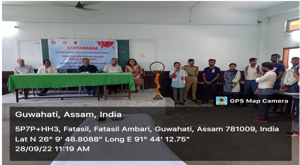
Figure 11: Voluntary blood donation camp "RAKTADHARA" organised by NCC unit along with the NSS cell of the college

The Unit, along with the N.S.S. Unit of the college, in collaboration with National Medicos Organisation, Assam, and Seva Bharati Purbanchal, organised a blood donation camp on September 28, 2022. The program saw active participation from 30 dedicated cadets. An impressive 38 units of blood bags were collected, with N.C.C volunteers contributing a noteworthy 22 units.