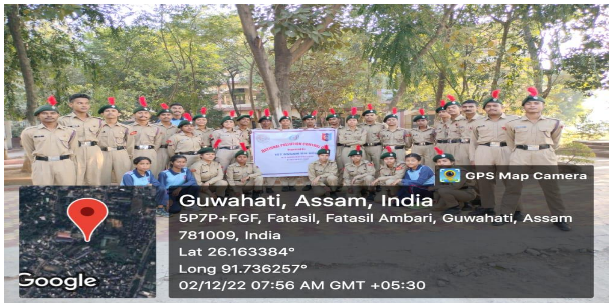
Figure 14: Cadets on National Pollution Control Day