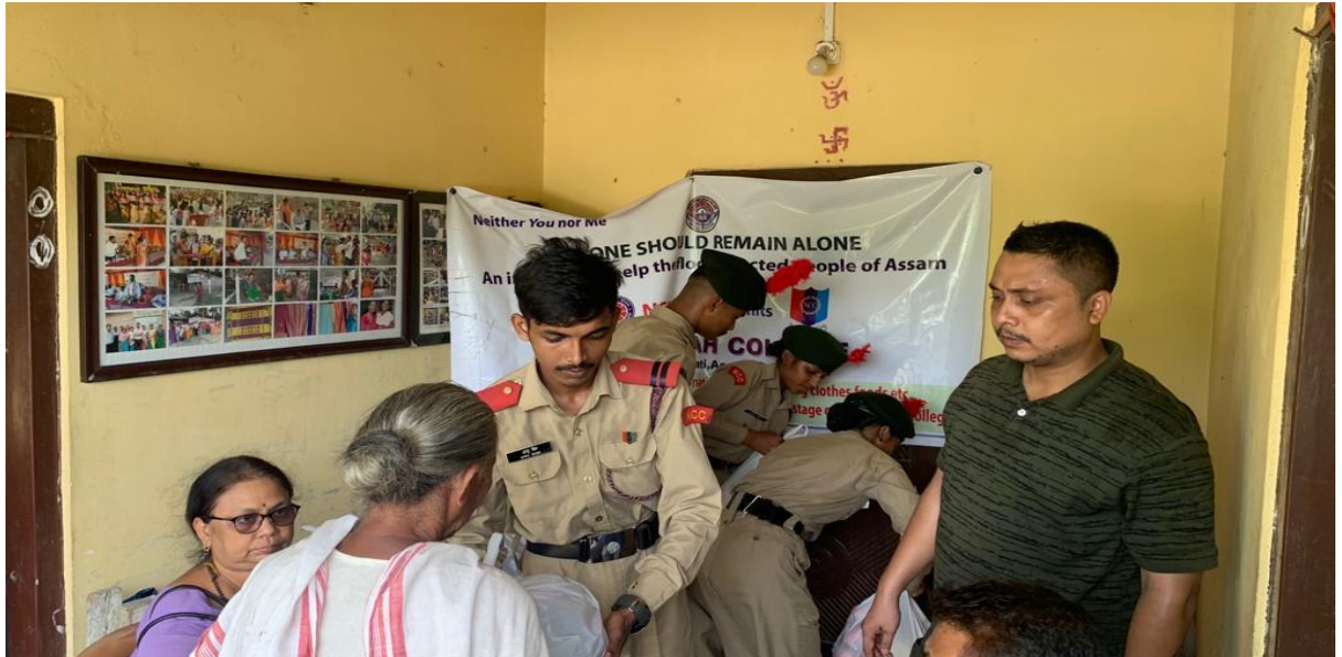
Figure 9: Cadets along with their CTO during distribution of flood relief supplies

In collaboration with the N.S.S. Unit of the college, the Unit organized a flood relief distribution at Chatra Village, Nalbari, on July 19, 2022. Essential supplies like food, clothing, and drinking water were provided at the relief camp, with the assistance of 17 cadets.