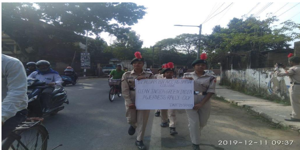
Figure 1: Cadets taking part in rally during Clean India Green India drive

Under the banner of "Clean India Green India", the Unit took a proactive step by organizing an awareness rally on December 11, 2019. In alignment with the same, a plogging event was conducted in the Lachit Nagar area along the banks of the Brahmaputra River. An encouraging total of 13 cadets actively contributed to the drive, reaffirming their commitment to a cleaner and greener India.